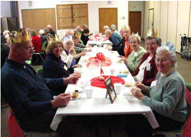
All who are celebrating birthdays during the month of the luncheon are invited to wear "birthday crowns" and enjoy a special dessert.