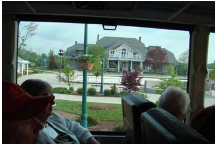
We saw Hershey in a new way through the bus windows.